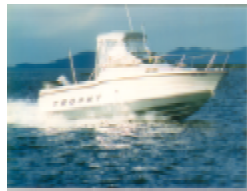
BC Style Fishing Charters