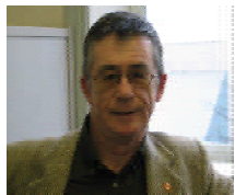
Softwood Industry Community Economic Adjustment Initiative Coordinator