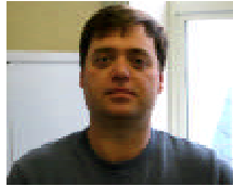
Enhanced Aboriginal Services Program